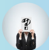
This could be You!